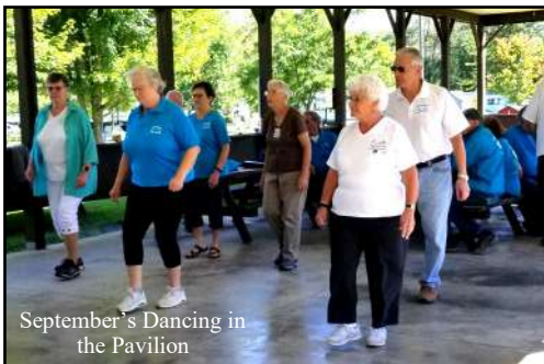
September's Dancing in the Pavilion