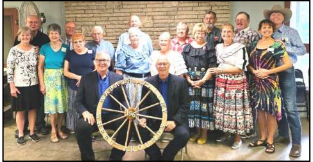
Good times in Nauvoo, IL

toric Site. We did, however, manage to find a Mexican restaurant to eat at for one of our evening meals. Another highlight was visiting a local museum on a steamship with a very knowledgeable curator/guide. The wonderful